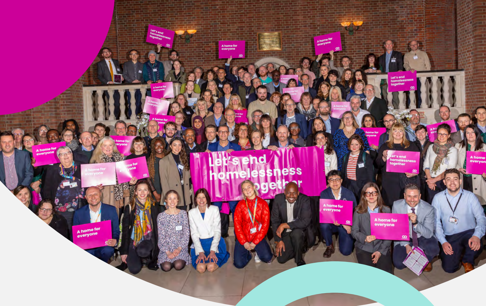
Pictured above: Homeless Link members unite at our Parliamentary Lobby to advocate for crucial changes to support people facing homelessness.